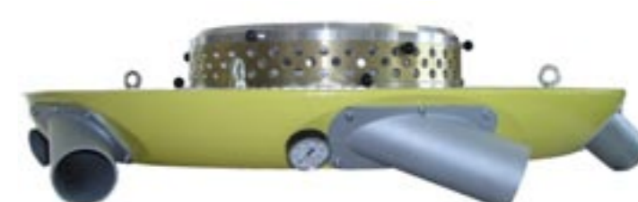
K-UL Series air ring from Plast-Control has independent control of primary and secondary air flows.

The die's low profile is achieved through a concentric mandrel design in which a series of concentric mandrels, one for each layer, nest within each other, reducing die height and weight. After polymer is pumped into the bottom of the die, it moves in separate channels into a tapered block. Compared to a stack die, the Optiflow LP die combines resin layers for a relatively short period at the end of the flow path, so reducing interfacial instabilities. The improved flow characteristics also reduce the