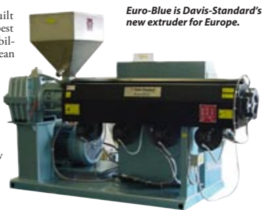
Euro-Blue is Davis-Standard's new extruder for Europe.

The new twin screw is a twin-screw version of the established 'off-the-shelf' single-screw XS-range. The KMD XS/PXS/P-range has been developed for standard profile extrusion applications in the lower to middle output range and can be delivered within four to six weeks. The company will be showing a