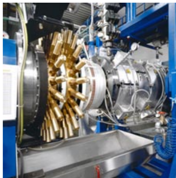
Krauss-Maffei's QuickSwitch adjustable calibrator allows pipe sizes to be changed without stopping the line.

Pipe producer makes its own corrugators: Hegler Plastik makes corrugated pipes on its own design of