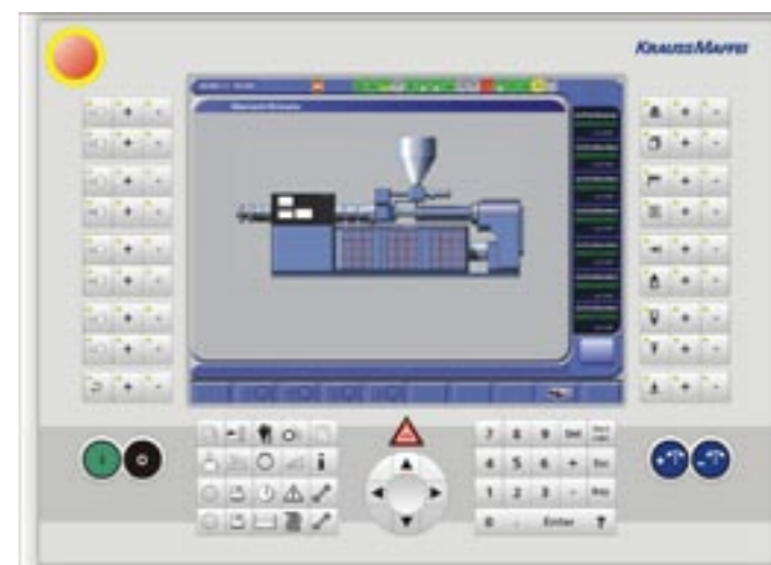
Krauss-Maffei's C5 is one of several new extrusion control systems based on WindowsXP.

The PPC-2000 offers processors complete production run documentation including features such as data communication, process monitoring and recipe storage. It also has auto